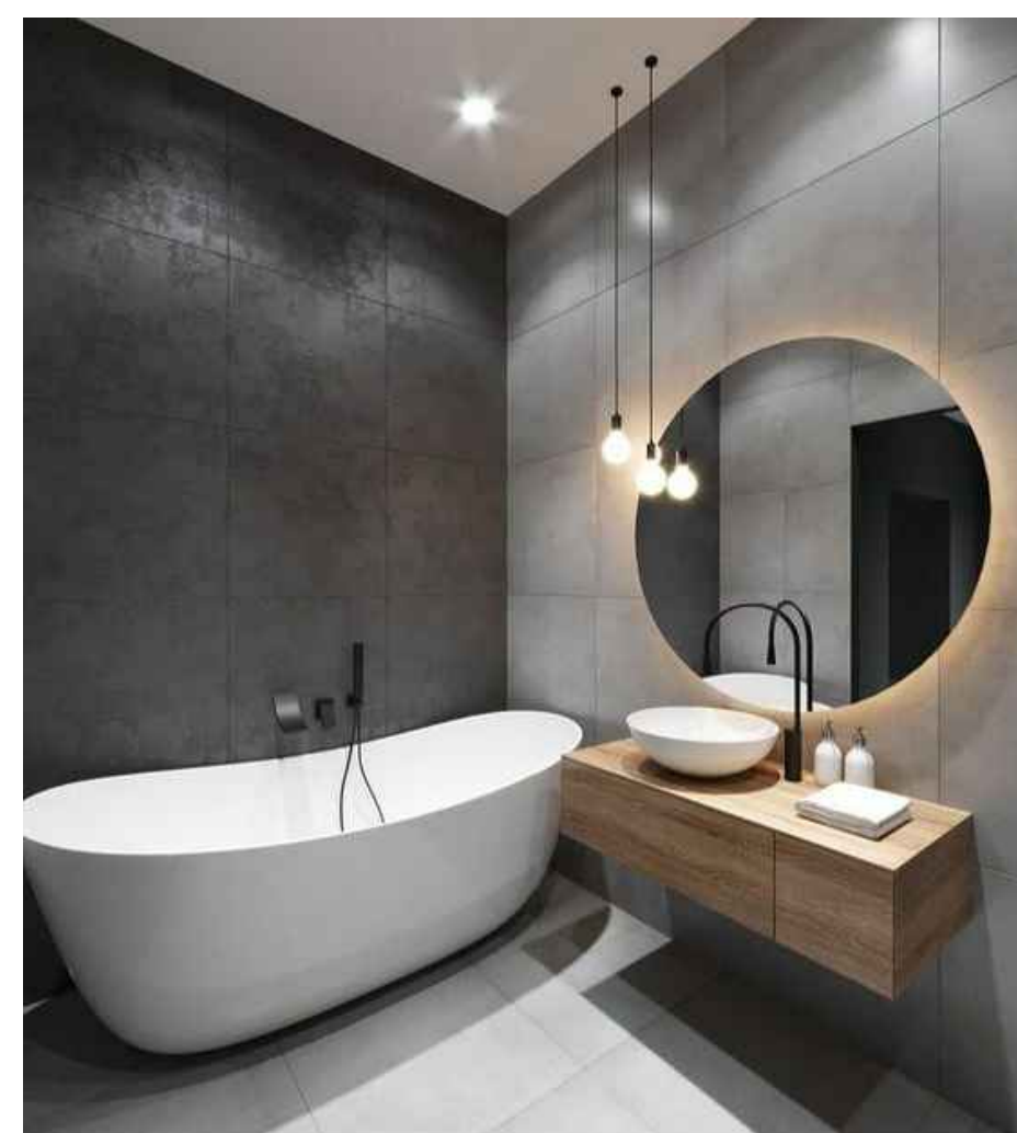
05 WALL TILES