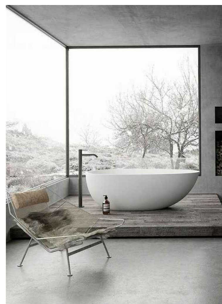
04 BATH PLATFORM