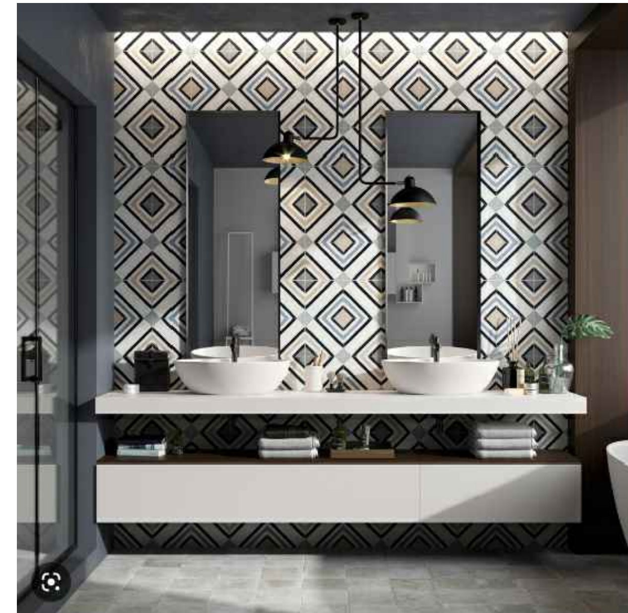
02 MASTER VANITY UNIT