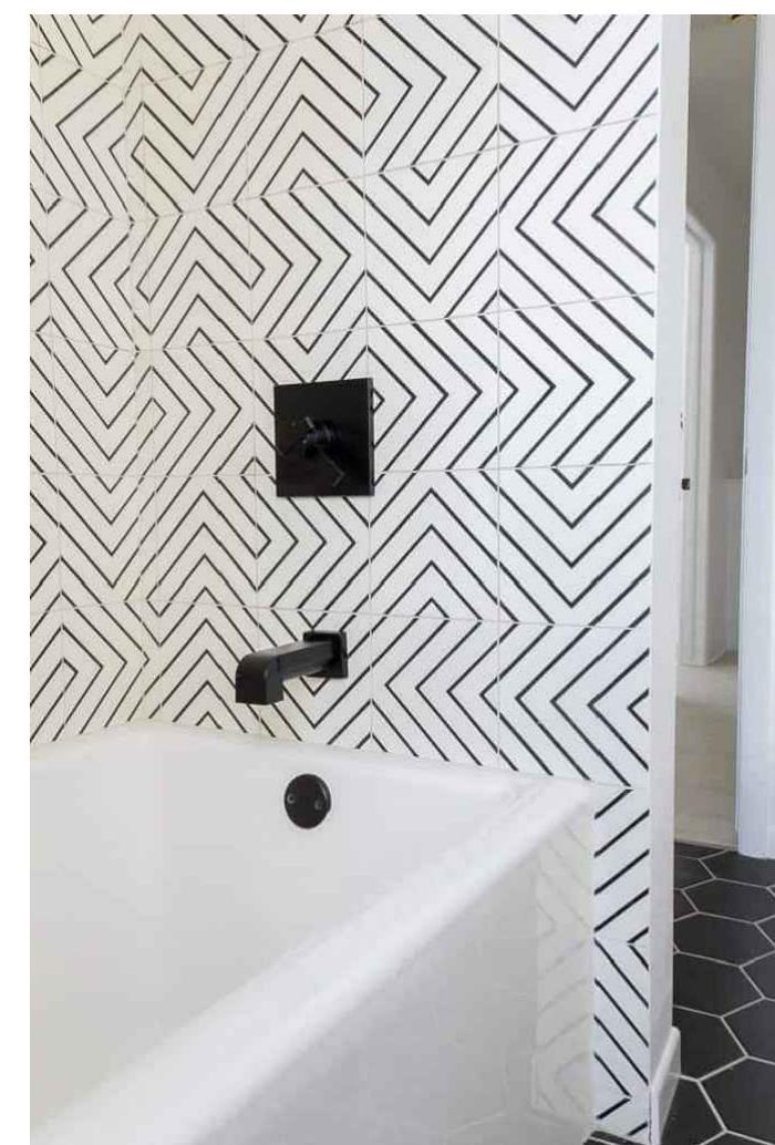
03 BLOCK TILING TO SHOWER / BATH