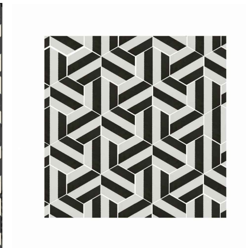
06 FLOOR / WALL TILING (BLACK & WHITE) GEOMETRIC PATTERNS