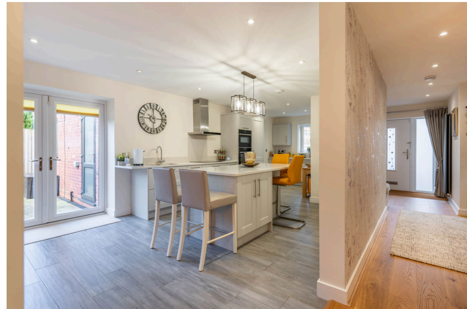
Fairways Drive, Blackwell

An impressive unique property built in 2020 boasting pristine contemporary accommodation of approximately 2,277 sq. ft including a fabulous open plan lounge/dining room perfect for entertaining, south westerly rear garden, double garage and room above with potential for conversion into a habitable room (subject to necessary permissions).