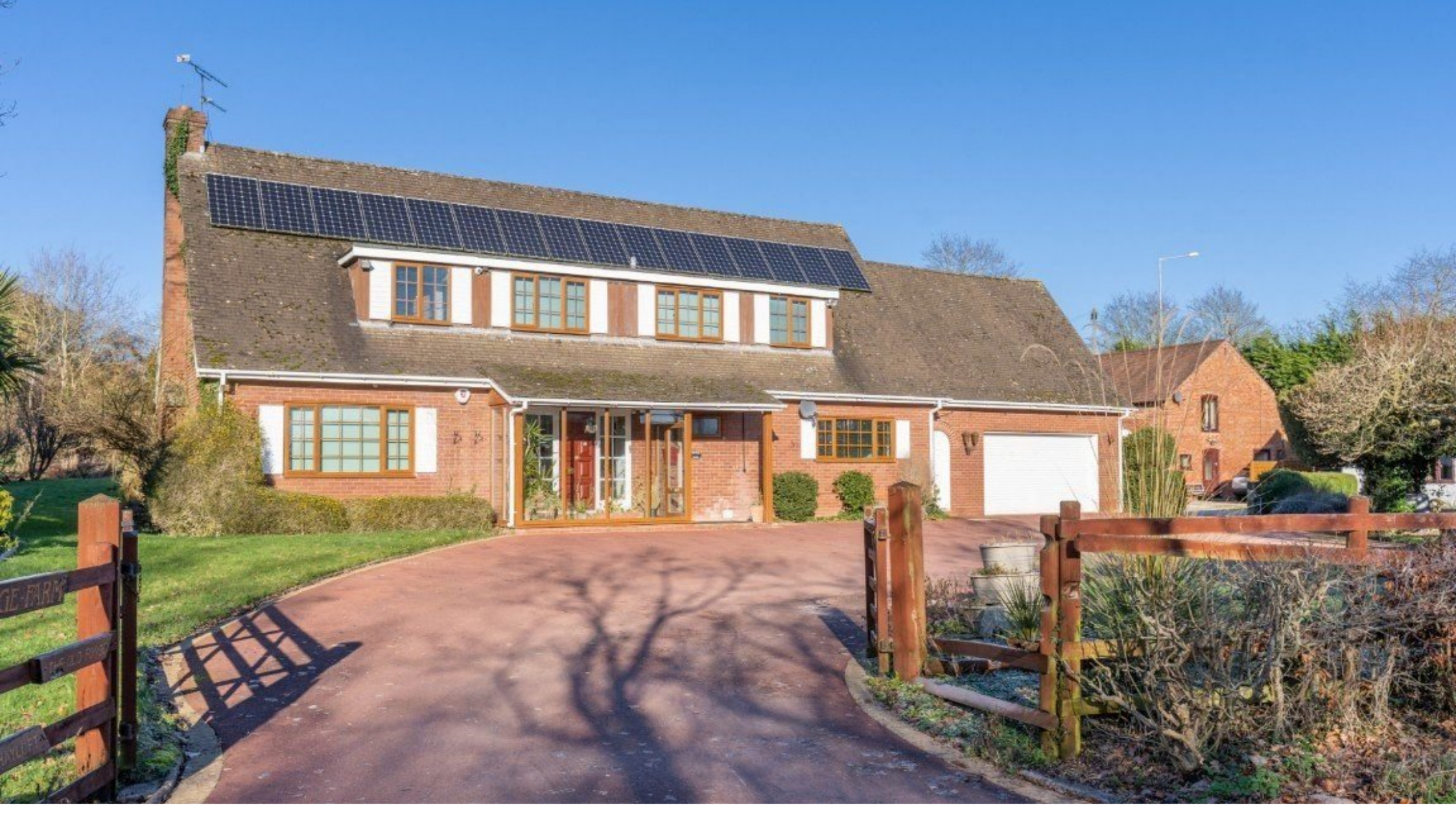
Bridge Farm House, Bittell Farm Road, Hopwood, Alvechurch, B48 7AF