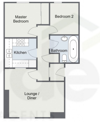
Total Area Approx 45.8 Sq M 493.0 Sq Ft

For illustrative purposes only. Decorative finishes, fixtures & fittings do not present the current state of the property. Measurements are approximate & not to scale.