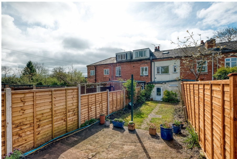
Greenfield Cottages, Scarfield Hill, Alvechurch Ground Floor