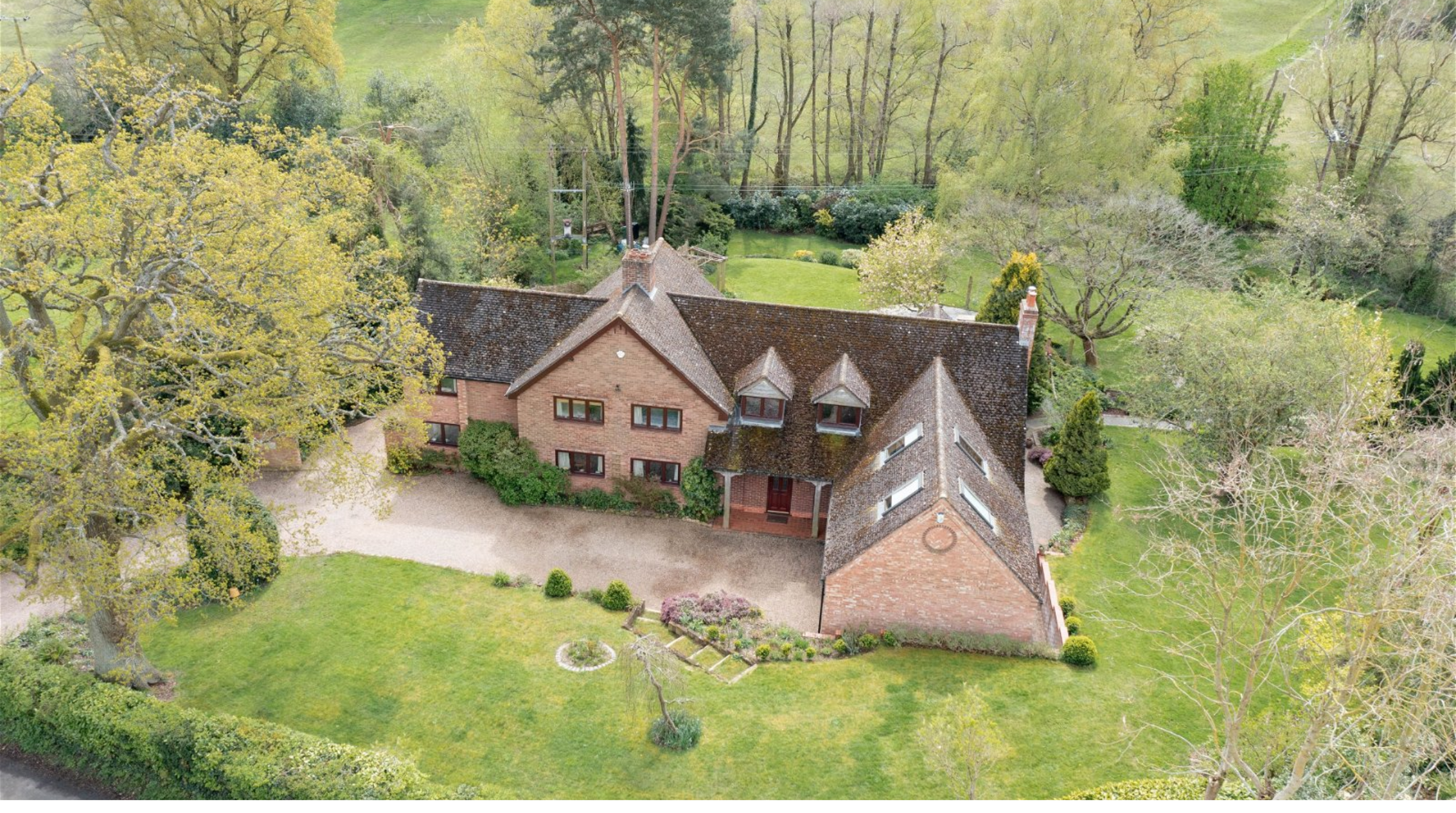
Springwood, Chapel Lane, Rowney Green, Alvechurch, B48 7QJ