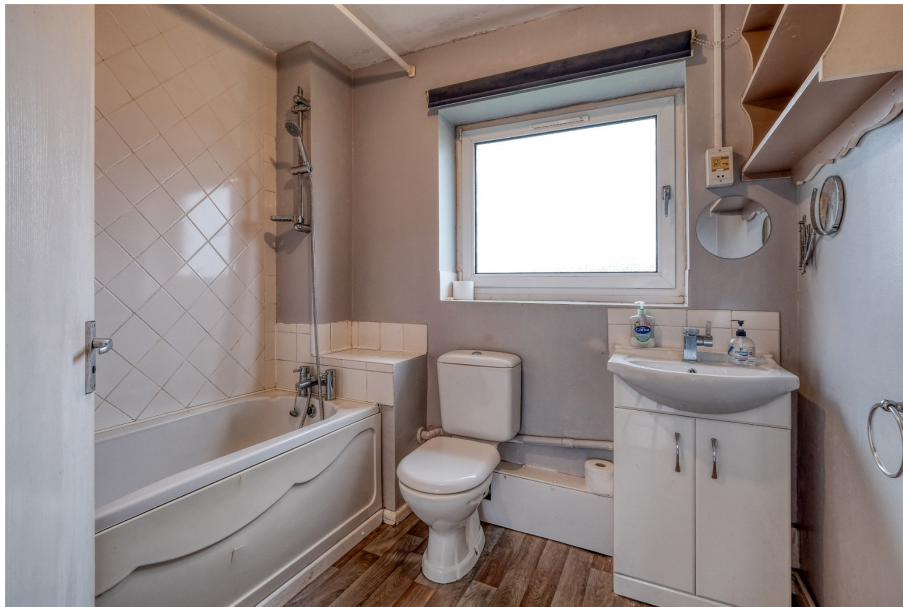
Aspen House, Longwood Road, Rednal