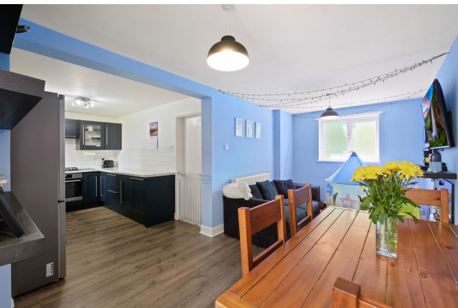
Woodcock Close, Northfield