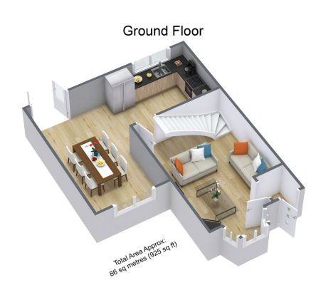
For illustrative purposes only. Decorative finishes, fixtures & fittings do not epresent the current state of the property. Measurements are approximate & not to scale

Welcome to this beautifully presented Three-bedroom end terraced house, nestled in the soughtafter area of Northfield. Perfectly designed for modern living, this home offers a blend of comfort, style, and functionality, ideal for families or professionals looking for a spacious and contemporary residence.