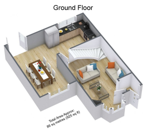
For Blustrative purposes only. Decorative finishes, futures & fittings do not

Welcome to this beautifully presented 3-bedroom end terraced house, nestled in the sought-after area of Northfield. Perfectly designed for modern living, this home offers a blend of comfort, style, and functionality, ideal for families or professionals looking for a spacious and contemporary residence.